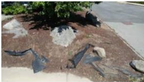
What happens over time when mulch is not maintained

6. LF is manufactured using petroleum and other chemicals. Over time it does break down and those chemicals along with significant amounts of micro-plastics, go into the soil. This is especially concerning if you use LF around edible plants. So, the land-scape industry for the most part now recommends amending the soil as is required and using a natural mulch to help conserve moisture, reduce weed growth, provide a consistent and attractive appearance, AND add organic matter to the landscaped area over time. Most landscapers today limit the use of LF to those projects where a stone mulch is being installed and they want to try to reduce the development of weeds throughout the stone.