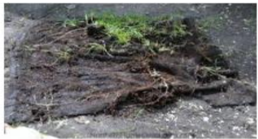
Warm-weather grass growing through landscape fabric

At the end of the day, there is nothing that is completely maintenance-free. Using landscape fabric will not make your project easier to maintain over time and is certainly not the best option for the environment.